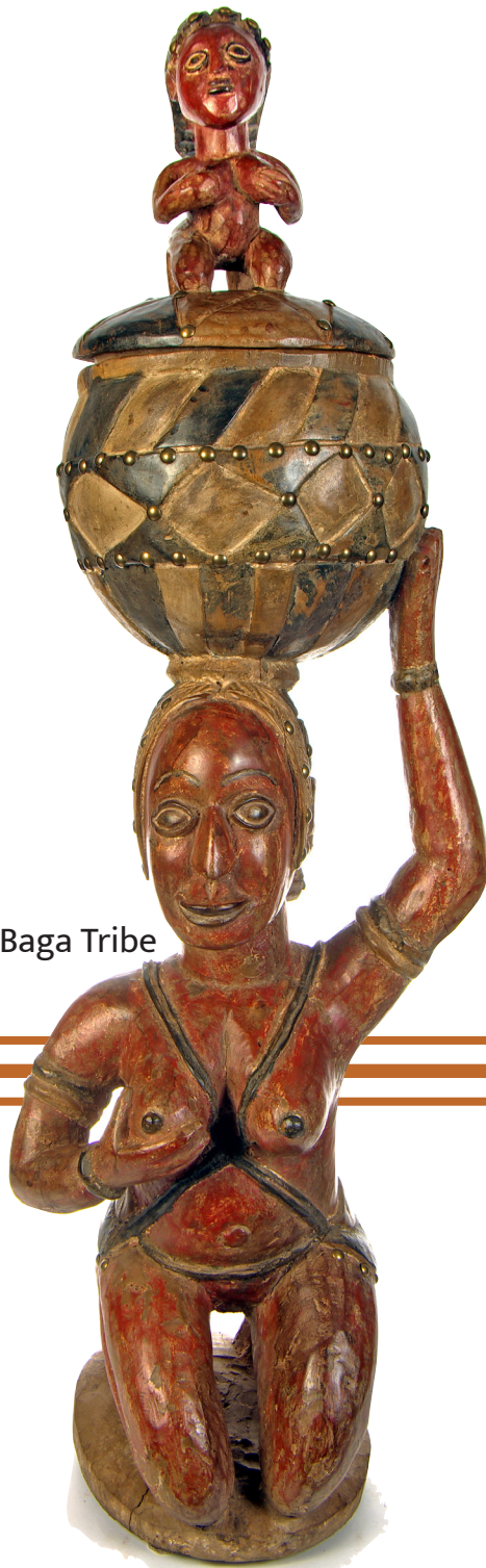
Hamilton Collection | Baga Tribe