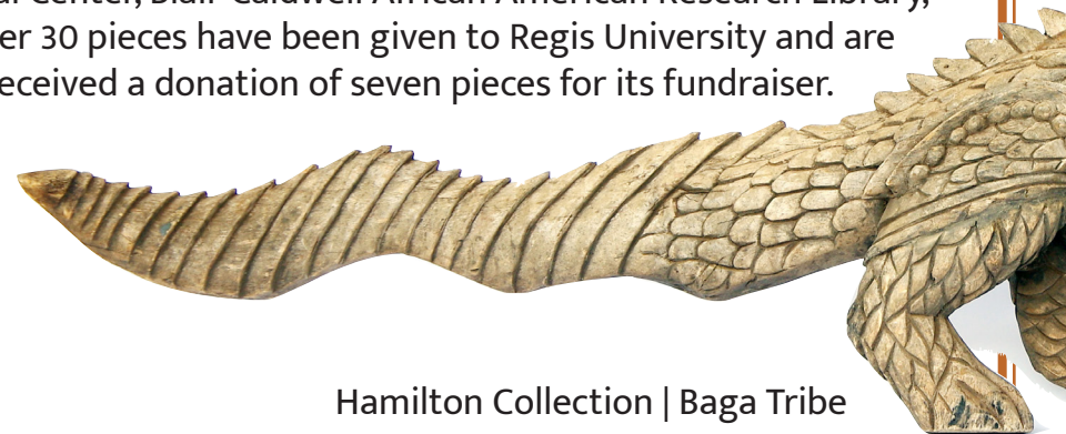
Hamilton Collection | Baga Tribe

Selections from the collections have been seen at the Lakewood Cultural Center, Blair Caldwell African American Research Library, and Cecil B. Moore Community Library (Philadelphia). Donations of over 30 pieces have been given to Regis University and are housed in its library's archives. Howard Dental Clinic (non-profit) received a donation of seven pieces for its fundraiser.