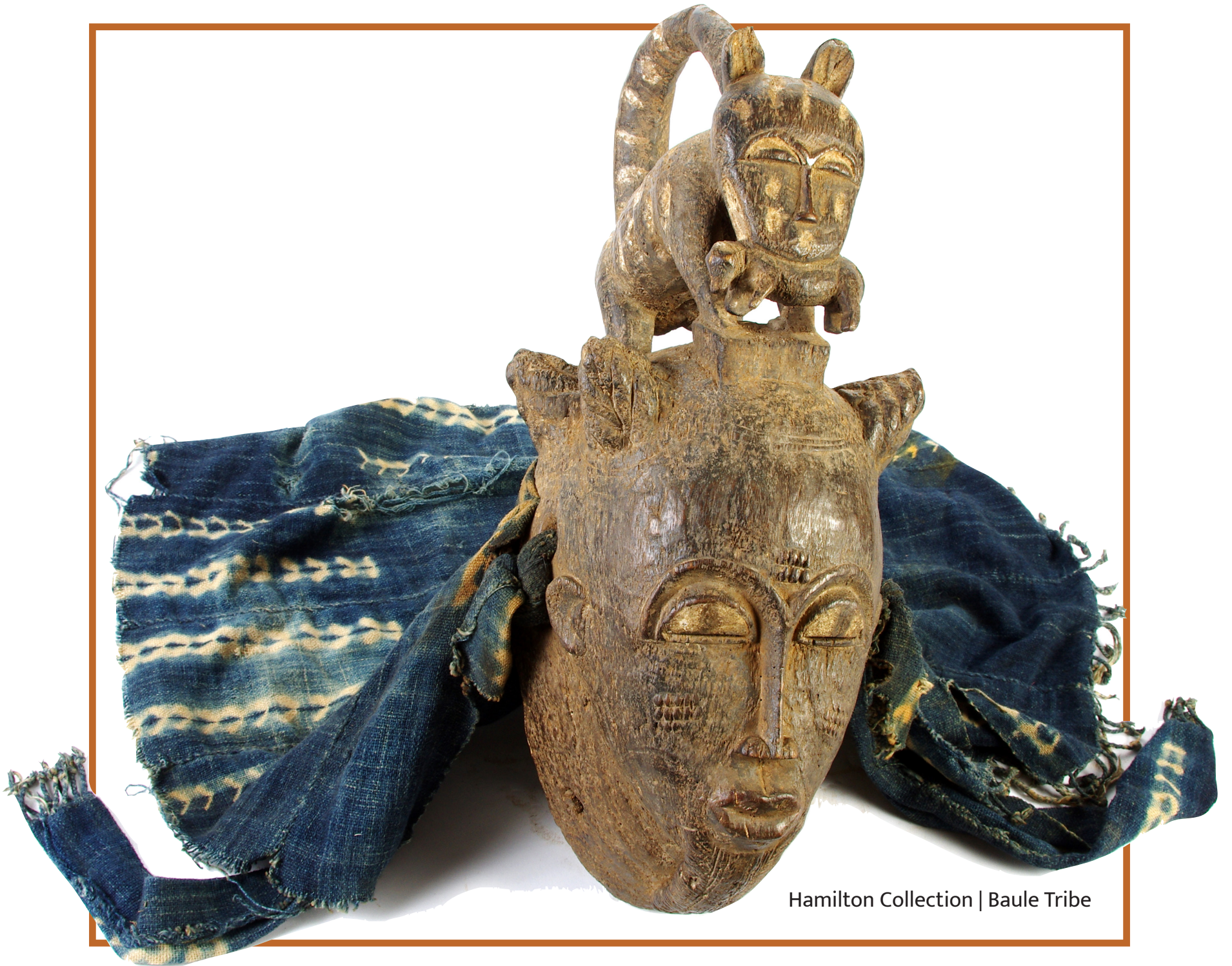
Hamilton Collection | Baule Tribe