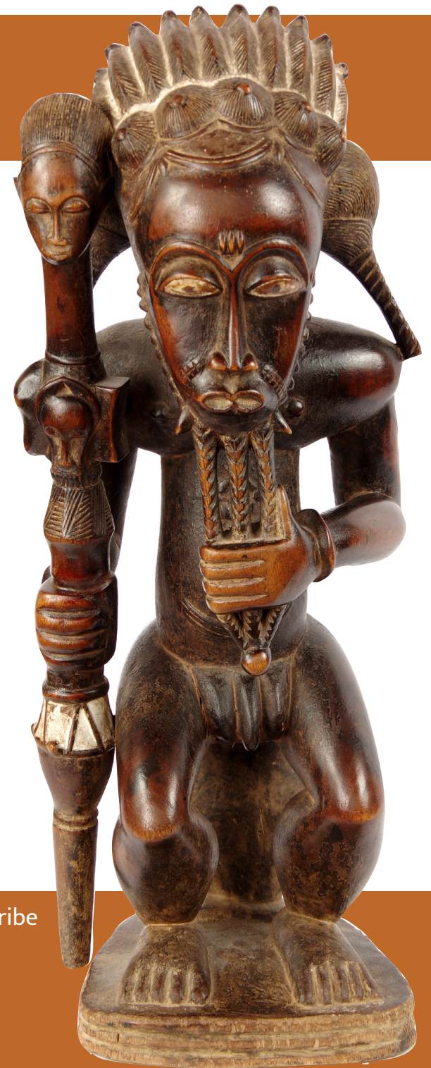
Hamilton Collection | Baule Tribe