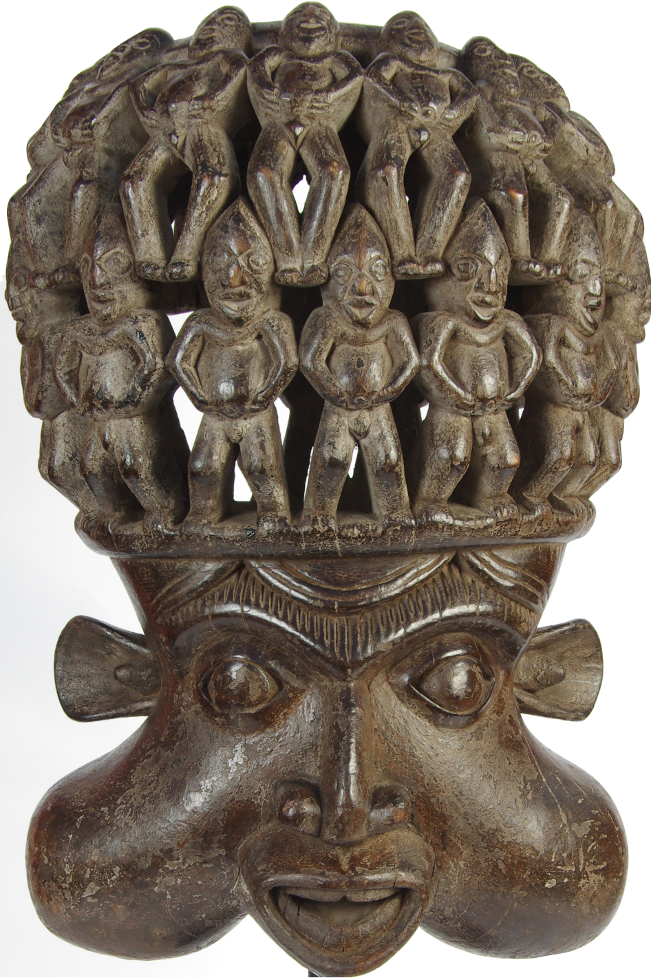
Hamilton Collection | Baumon Tribe